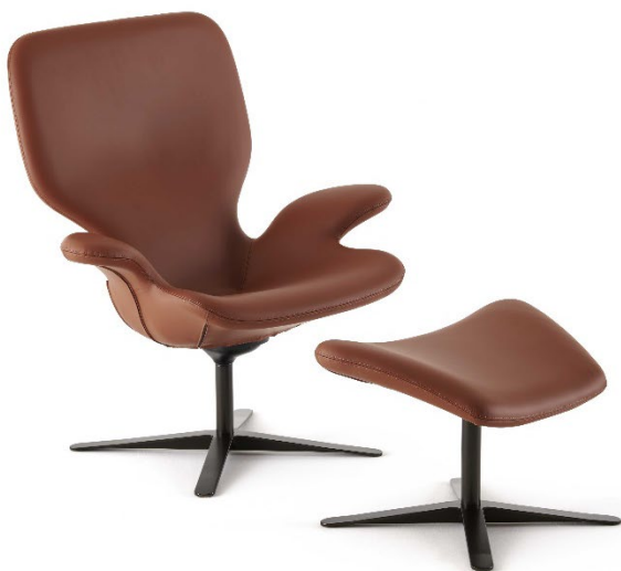
Clarke armchair and pouf in Soft leather.