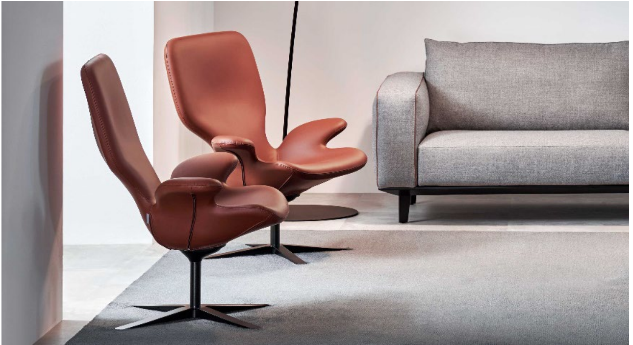
Clarke armchair in Soft leather.