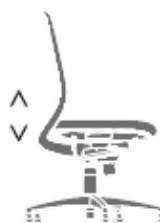
Lumbar support adjustment - standard