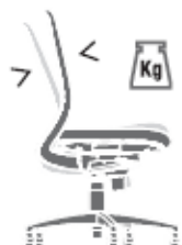
Backrest tension adjustment - standard