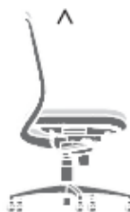
Height adjustment - standard