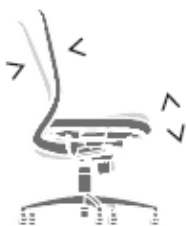
Syncro mechanism - standard