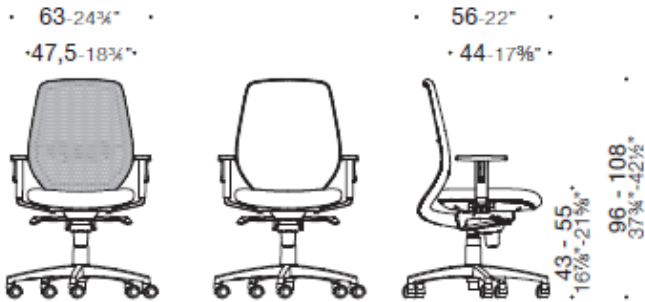
First, chair with backrest in mesh or padded