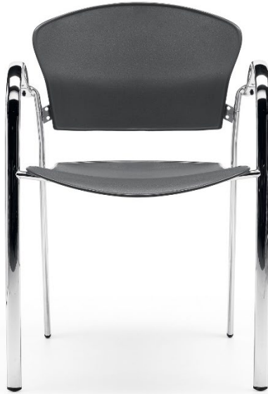
Cameo, 4 legs chair with armrests, stackable