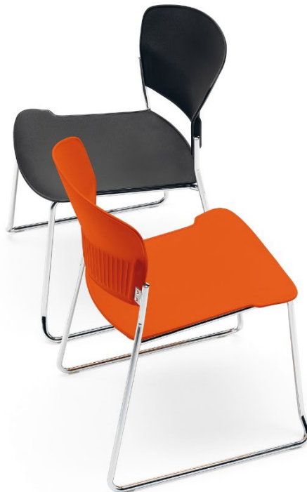
Cameo, cantilever chair, stackable